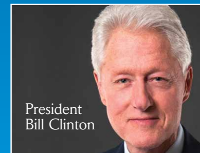
President Bill Clinton