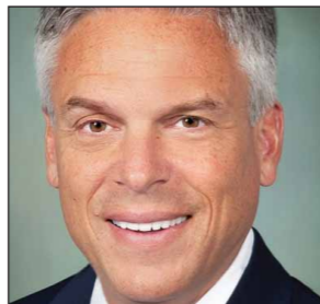
Jon Huntsman Jr.

Named one of the 100 Global Leaders for Tomorrow by the World Economic Forum and currently an analyst for ABC News, Goolsbee provides perspective on the global economy, financial headwinds, and what they mean for the future of business and financial markets. A distinguished scholar, he vibrantly shares insights on the challenges we face in a new economic reality.