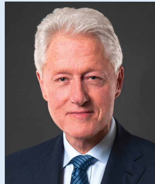
President Bill Clinton

Nobel Prize winner and former Secretary of Energy, Dr. Chu is at the forefront in the development of clean, sustainable energy. He advised the president on fracking, helped BP stop the gulf oil leak, and advised Japan in dealing with their tsunami damaged nuclear reactors. He returned to Stanford and holds appointments in Physics and Molecular and Cellular Physiology.