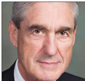
Robert Mueller III