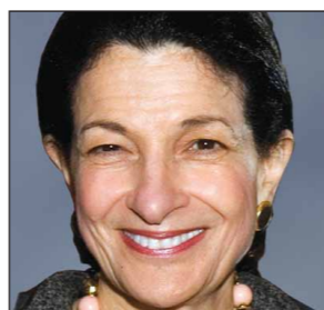
Senator Olympia Snowe