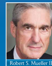
Robert S. Mueller III