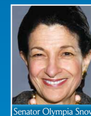
Senator Olympia Snowe