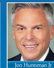
Jon Huntsman Jr.