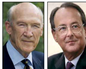
ALAN SIMPSON and ERSKINE BOWLES

Former chancellor of Washington D.C. public schools, subject of cover stories in Time and Newsweek and a prime subject of the movie "Waiting for Superman", Michelle Rhee is considered by many to be the catalyst for change needed in the American education system. She will give us her insight into bringing change to the D.C. school system and her new venture in effecting change through the political process.