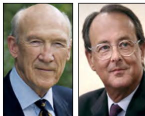
ALAN SIMPSON and ERSKINE BOWLES

Former chancellor of Washington D.C. public schools, subject of cover stories in Time and Newsweek and a prime subject of the movie "Waiting for Superman", Michelle Rhee is considered by many to be the catalyst for change needed in the American education system. She will give us her insight into bringing change to the D.C. school system and her new venture in effecting change through the political process.